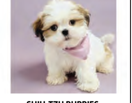
SHIH-TZU PUPPIES Beautiful Males & Females Price to Sell Call 718-306-4136