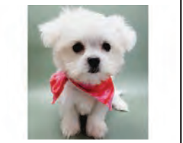
MALTESE PUPPIES Adorable males and females, toy or teacup sizes, shots and papers. Call 718-306-4136.